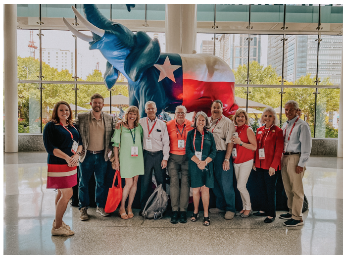
Midland delegates gather for a picture with the GOP elephant.