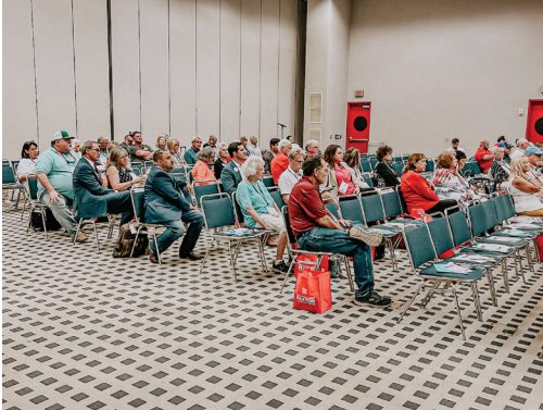
District 31 delegates attend their caucus meeting

What a wonderful time we had at the 2022 Texas GOP Convention June 16-18 in Houston, Texas! The Republican State Convention is held every two years. Midland County was well represented with thirty-two delegates in attendance -sixteen of those for the first time. We enjoyed three days, filled with meeting and hearing from elected officials, attending our SD 31 Caucus meetings, attending general sessions, ice cream socials, Governor Abbott's fun party to the Rustic Venue, fellowship, and great meals shared together.